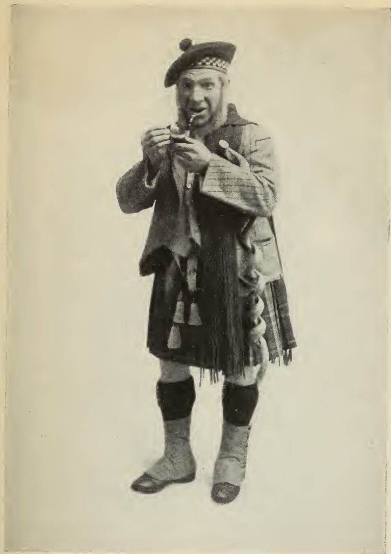
"WHEN I WAS TWENTY-ONE"